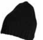
018 - KAAKA