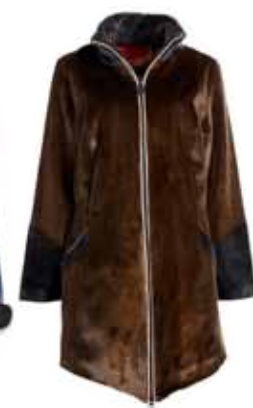
15 - SAPU