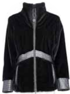
03 - KAKALIK