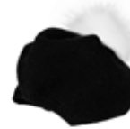
18 - ALEGA