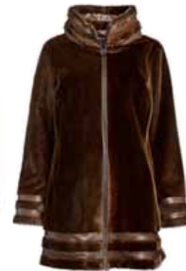
07 - NUKAACA