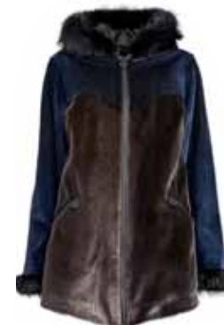
12 - PANINGUAG