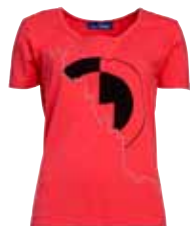
0A - NAVARANA