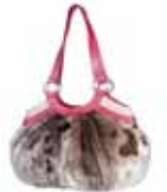
27 - PIPALUK