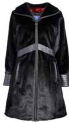
17 - AMI