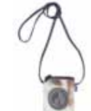
21 - NANNA