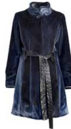
14 - INALUNNGUAG