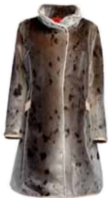
20 - NAASOQ