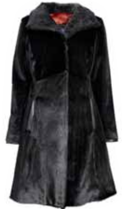
21 - IKIUNA