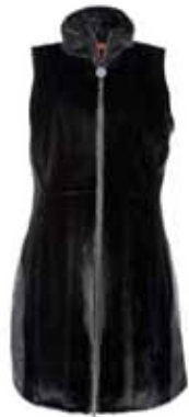
10 - PANEERAG