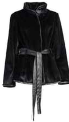
05 - IVALU