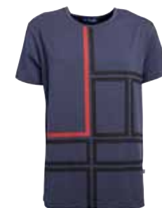
07 - MIKI