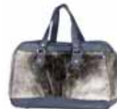
02 - SOFIA