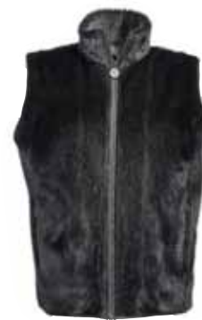
03 - SALIK