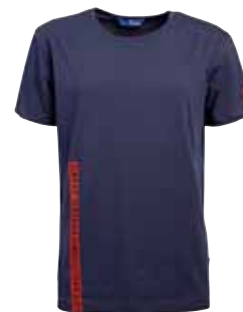
0d - ISAAK