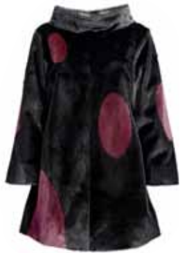
02 - PILU