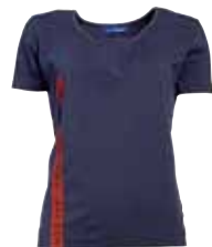
00 - NIVIKKA