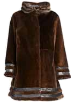
16 - AJAJA