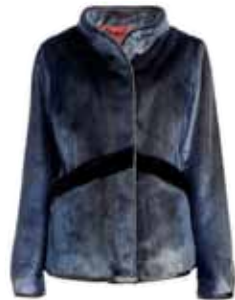
06 - PAARNAG