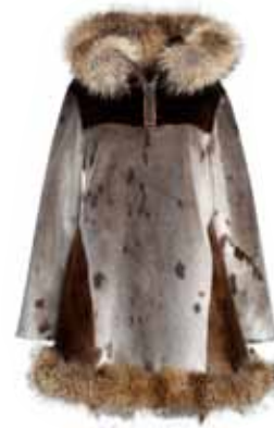
09 - NAPU