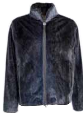
04 - AATI