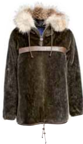
05 - ARI