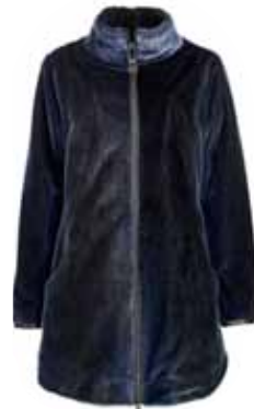
11 - ARNAJARAG