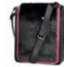
29 - PANIK