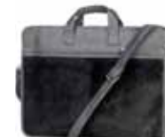
23 - ILANNGUAG