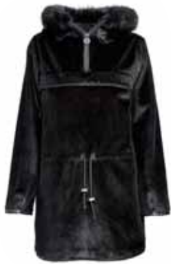
18 - MAKKA