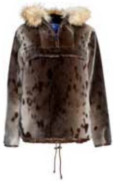
01 - NIKKI